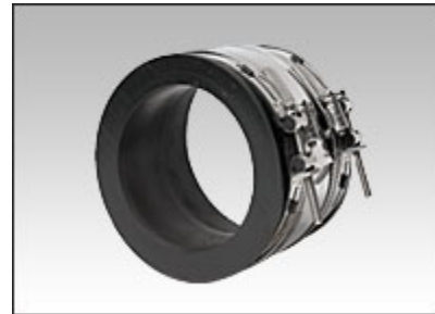
Fernco® 5000 Series RC Couplings (60 in-lb)