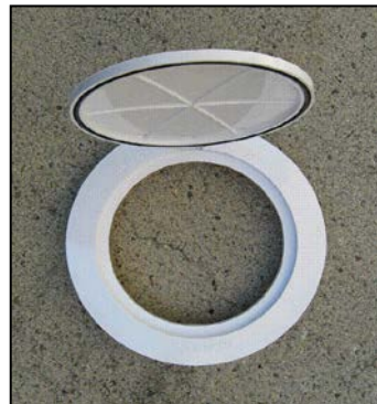
Sewer Relief Cap (6" Clean Outs Only)