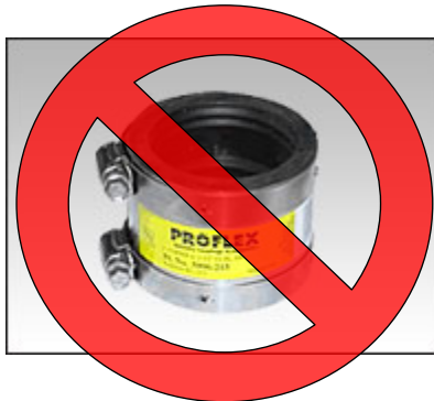
Fernco® Proflex Coupling