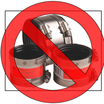
Mission® Band Seal

Note: Check with Inspector prior to purchase of material to insure proper coupling is selected for the different pipe types encountered.