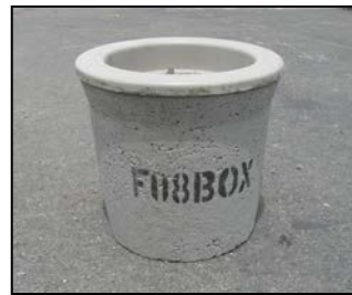
Christy® F8 Box