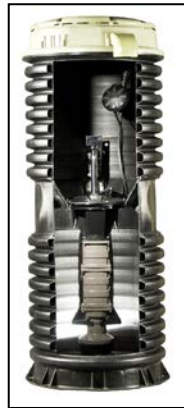
E-One® Model D-H071

Note: Complete packages are required for Pre-Approved Pump Systems. This includes a pump, alarm panel, isolation and check valves, sump and sump extensions (as required). Individual parts of Pump System are not pre-approved by CCCSD. Models include but are not limited to the ones below, contact CCCSD for special approval of all others.