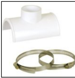
Saddle Tee Fitting