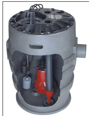
Liberty® Pro370-Series (2" discharge system, Required Access Riser)