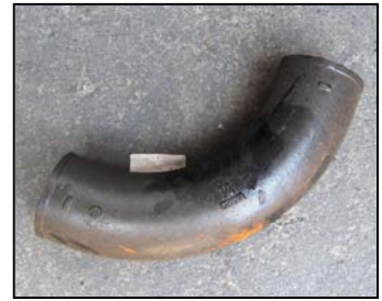
Long Sweep Quarter Bend