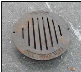
Christy® K-6004 Grate (Special Order)