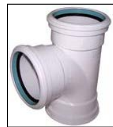
Wye, Tee Fitting