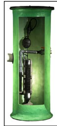
E-One® Model Gator Grinder