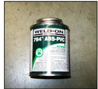
Weld-On® ABS-PVC Cement