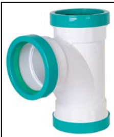
SDR 26 Heavy Wall Gasketed Sewer Fitting