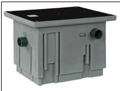
Schier Products Trapper II* PATG-2025 or PATG-2420