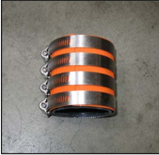
Husky® 4 Clamp Coupling (80 in-lb)