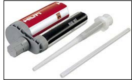
HIT HY150 Adhesive Anchor