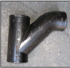
Combination Wye and (1/8) Bend