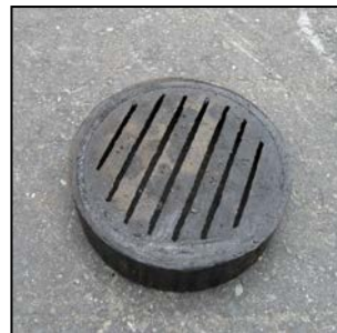
Christy® V1-71C Grate