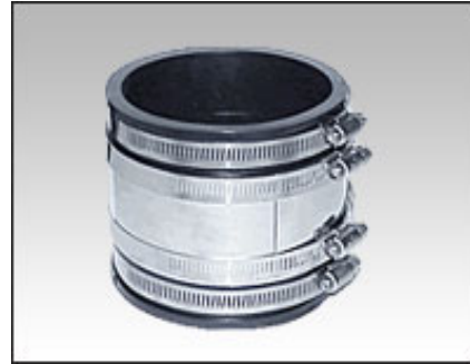
Fernco® Stainless Steel Shear Rings (60 in-lb)