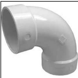
90° Sweep Elbow for pressure side sewers