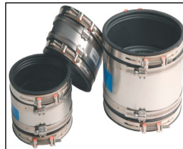
Mission® Adjustable Repair Coupling