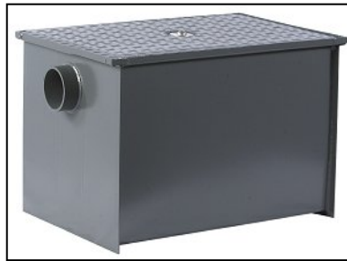
Dormont WD Series