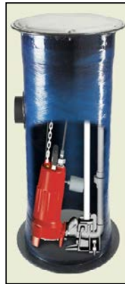
Liberty® 2448 Series