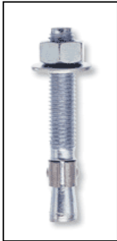
Trubolt Wedge Anchor