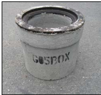
Christy® G5 Box