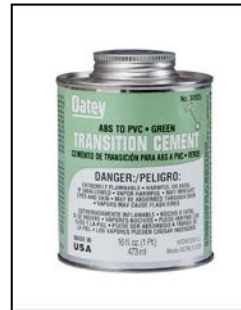
Oatey® ABS-PVC Cement