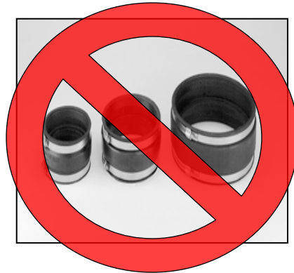
Joints® Calder Coupling