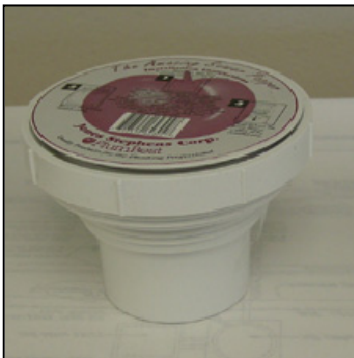
Sewer Popper™ OPD