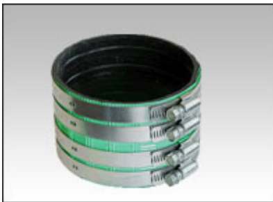
Fernco® No-Hub Couplings Silver (60 in-lb) Yellow & Green (80 in-lb)