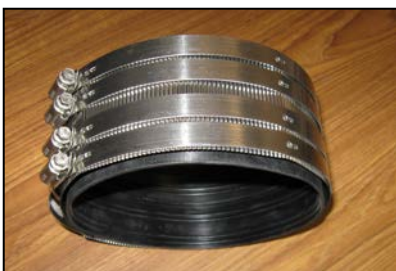
Anaco No Hub (60 in-lb)