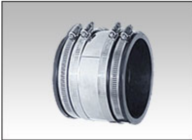
Fernco® Strong Back RC Couplings (60 in-lb)