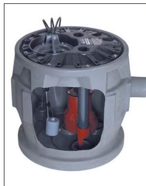
Liberty® Pro380 Series (2" discharge system, Required Access Riser)