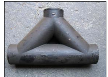
Two Way Combination (Clean Out Only)