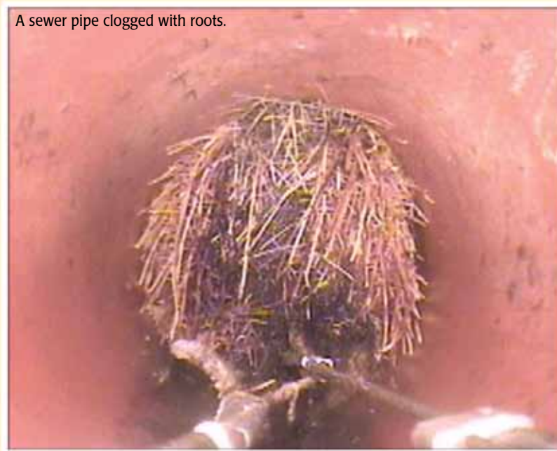
A sewer pipe clogged with roots.

A professional home inspection will cover the interior and exterior of the house. It will rarely include an inspection of the building's sewer (known as the private sewer lateral or side sewer), especially if the house is connected to the public sewer system.