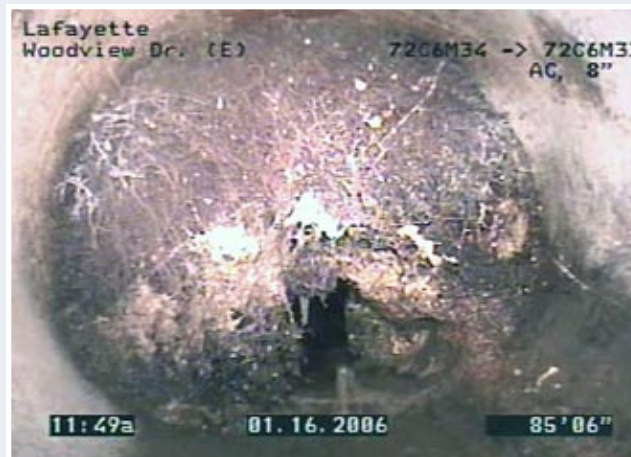
Roots clogging a pipe.

Millions of gallons of wastewater travel from all over central Contra Costa County to our treatment plant in Martinez every day, flowing through more than 1,500 miles of sewer pipes beneath our feet. Those pipes vary in size from four inches to eight-and-a-half feet in diameter, and some of them have been in the ground for more than 60 years.