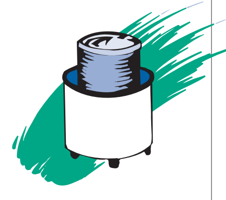
You can buy secondary containers to hold a single drum. For outdoor storage, you'll need a cover.