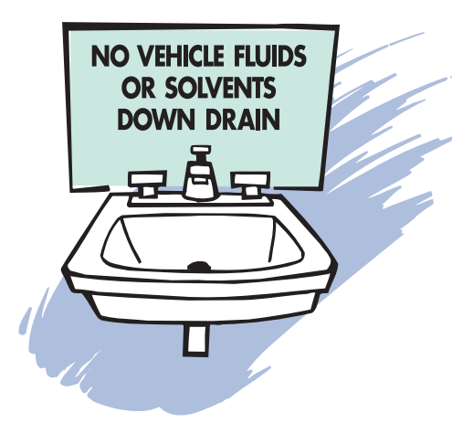
Make sure employees know the rules.