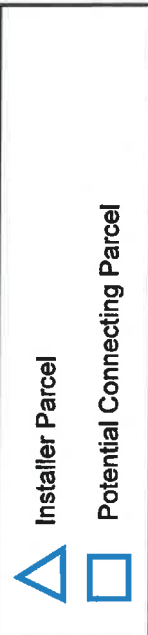
Exhibit A - Job 6456 Paseo Nogales Road, Alamo CA